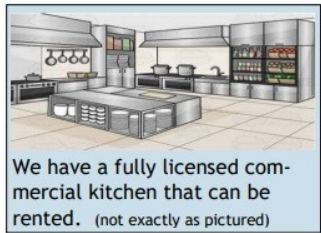
We have a fully licensed commercial kitchen that can be rented. (not exactly as pictured)