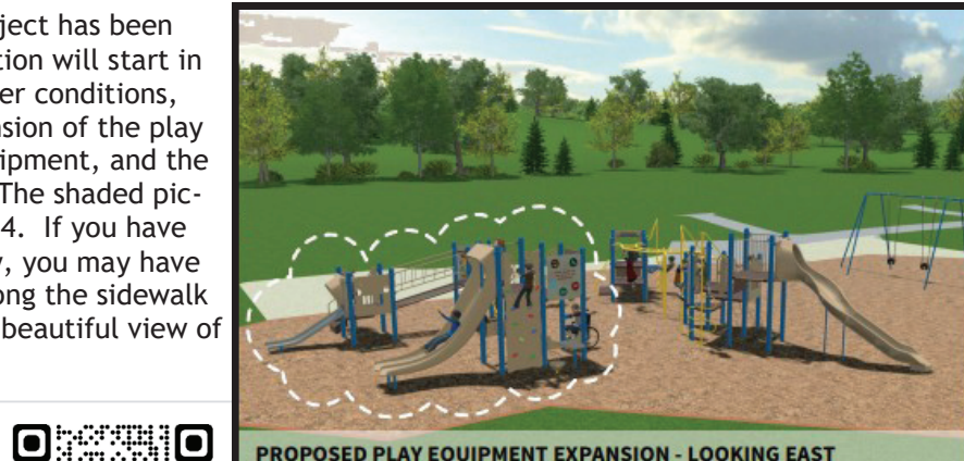
PROPOSED PLAY EQUIPMENT EXPANSION - LOOKING EAST

The Foundation accepts donations by cash, cheque, or online EXAMPLE OF PICNIC SHELTER at www.CanadaHelps.org (search for the charity "Linden Woods Community Foundation").